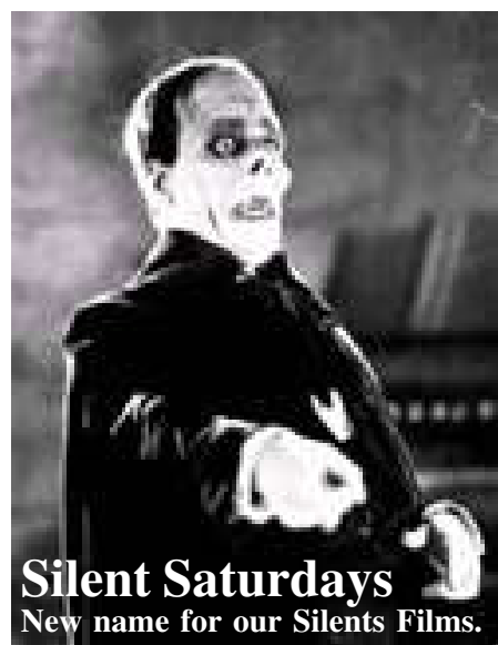
Silent Saturdays New name for our Silents Films.

in the Bulpitt Auditorium at Phoenix College. Nominating committed to be appointed. After a couple of years of current work, (not to forget the years in the 70s) the Wurlitzer is now up and running. We're not there yet, but there is plenty going on. Artist(s) are planning a great program. There will be a Power Point slide presentation of the ATOS Summer Youth Camp. Park in the lot on the northeast Corner of 19th Avenue & McDowell.