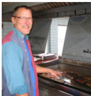
VOTS people enjoying music and breakfast of pancakes, eggs, bacon and sausage